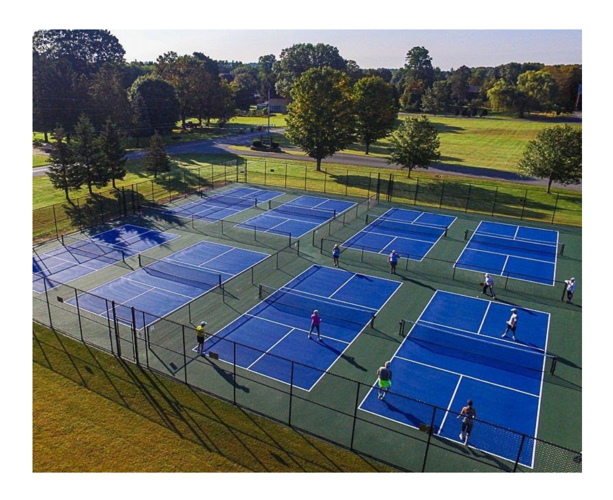
January 14, 2021