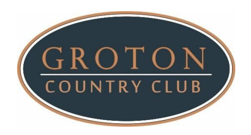
SHAWN CAMPBELL, PGA