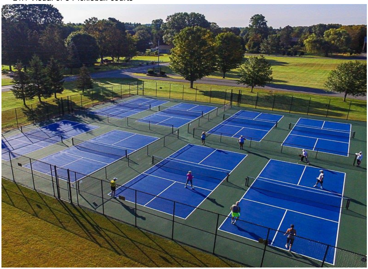
Figure 21.2. USA Pickleball Association Pickleball Dimensions